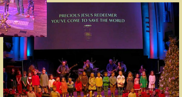
The Children's Choir performing during the EPIC Christmas Eve Service