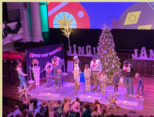
A great time was had by all at Jingle Jam!