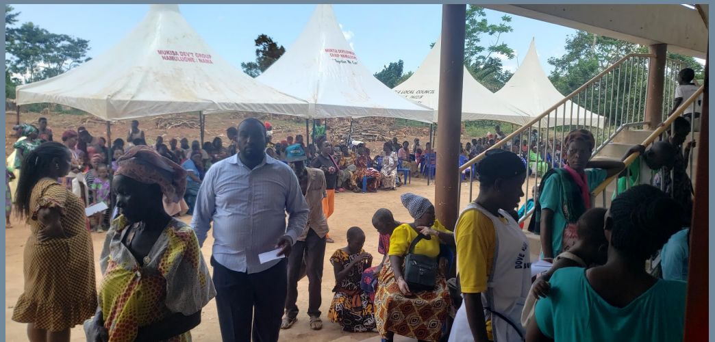
waiting for the medical team