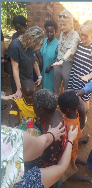
praying for the widows