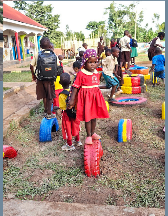
playing with the orphans