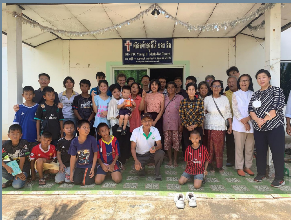
Thailand Methodist Church